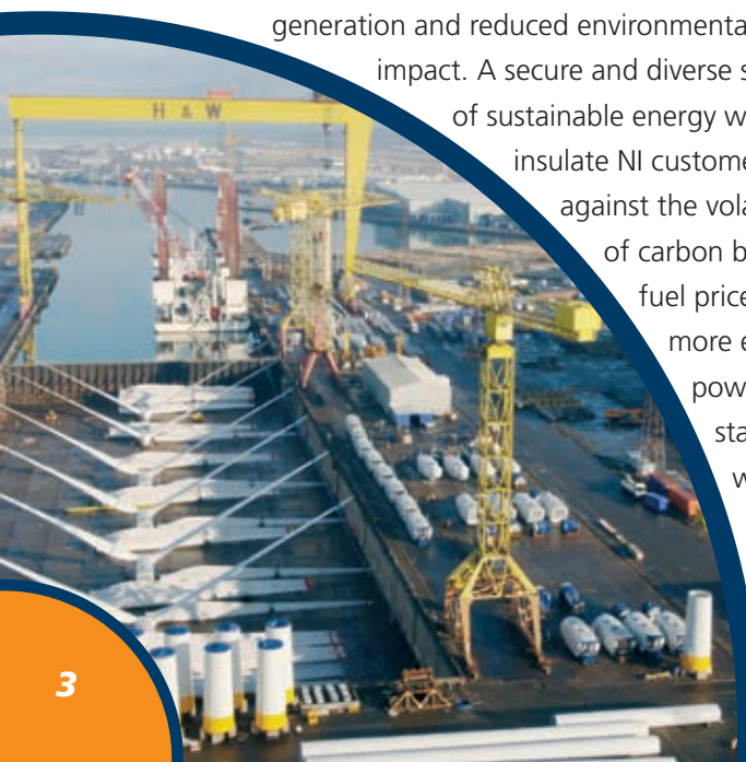
Offshore Wind Farm Logistics at Belfast's shipyard

The Obligation has already stimulated the investor confidence necessary to secure the prospect of £500 million of private investment in the Northern Ireland energy system and the amount of electricity supplied from renewable sources in Northern Ireland has doubled in the past twelve months.